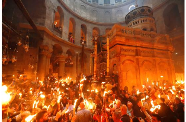
Photo of the Holy Fire being distributed from Christ's tomb in Jerusalem.

We have candles for you that have clear protectors that help shield them from the breeze and help eliminate dripping if you hold your candles straight , as we want to take good care of our church.